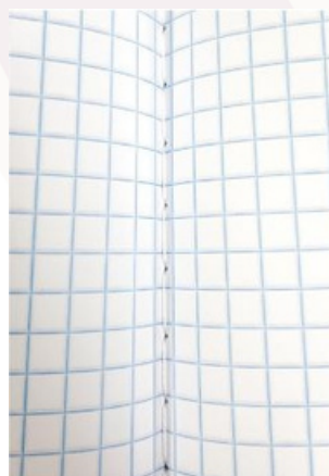
Figure 2: Lab Notebook Binding. Above, note the stitching down the middle at the center of the notebook.